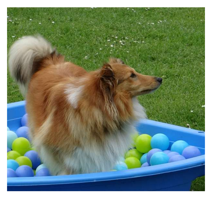
Fun and games at Sheltie Camp