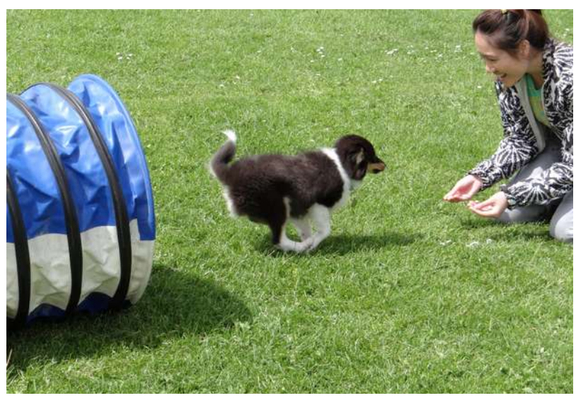
New experiences at Sheltie Camp