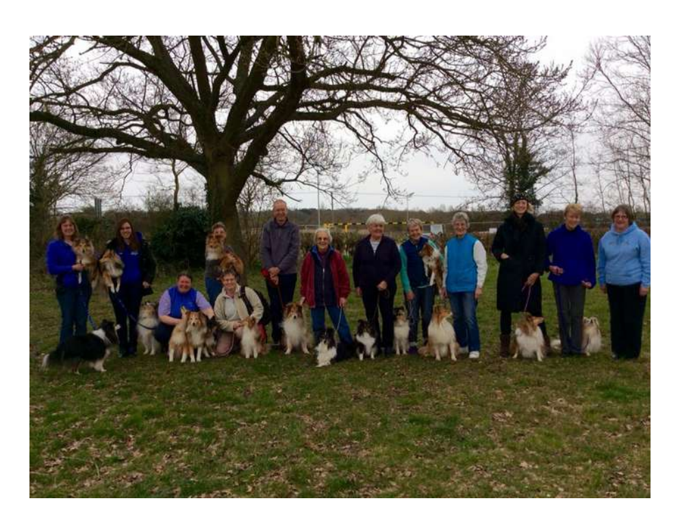
Working Section Rally Training Day April 2<sup>nd</sup> 2016