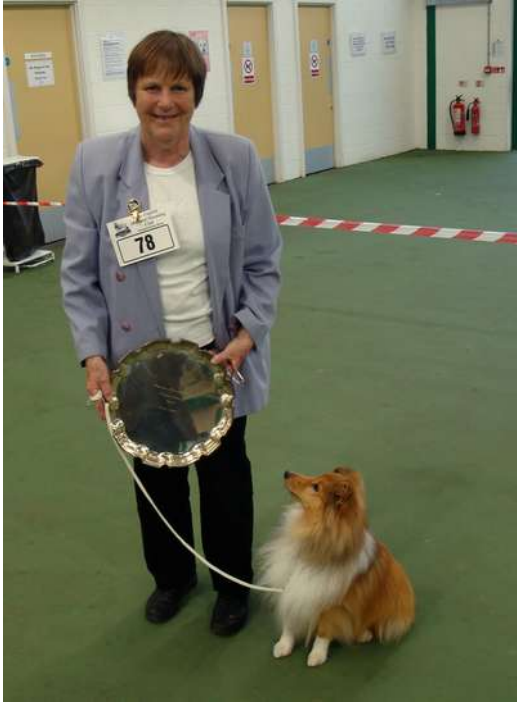
Miyrowan Salver Dog Winner