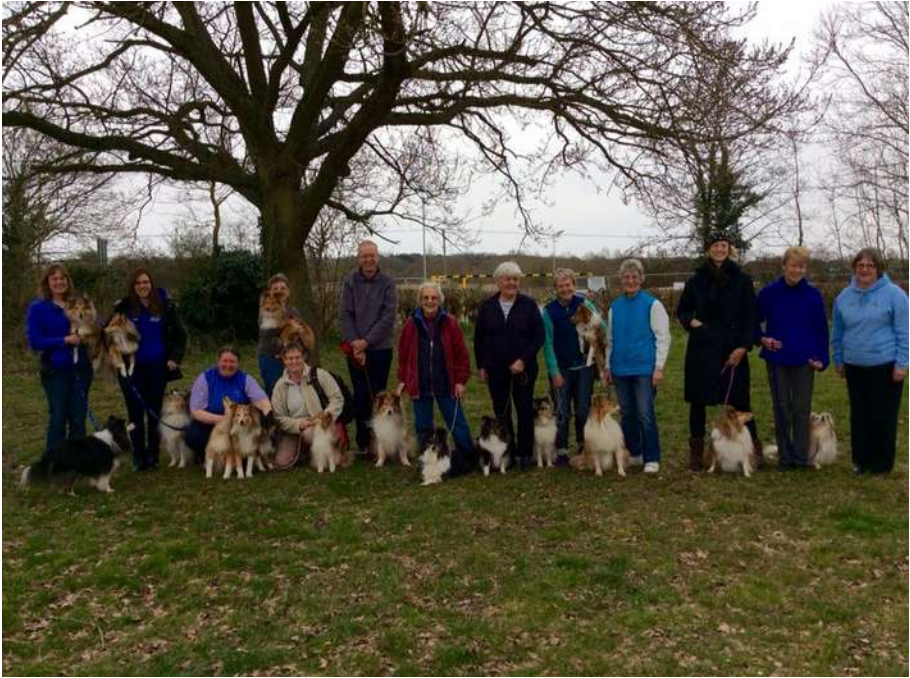
Working Section Rally Training Day April 2 nd 2016